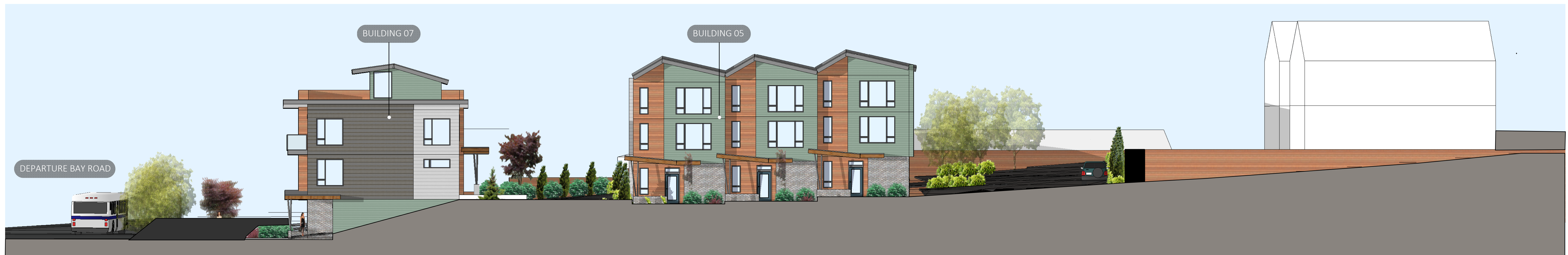
EAST WEST SECTION | Scale 1:120 |