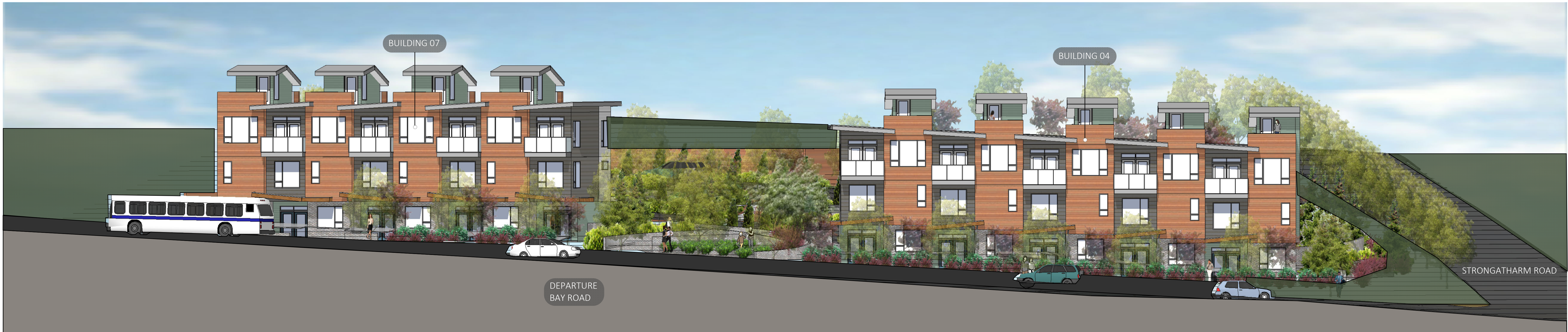
NORTH SOUTH SECTION | Scale 1:120 | (FROM DEPARTURE BAY ROAD)