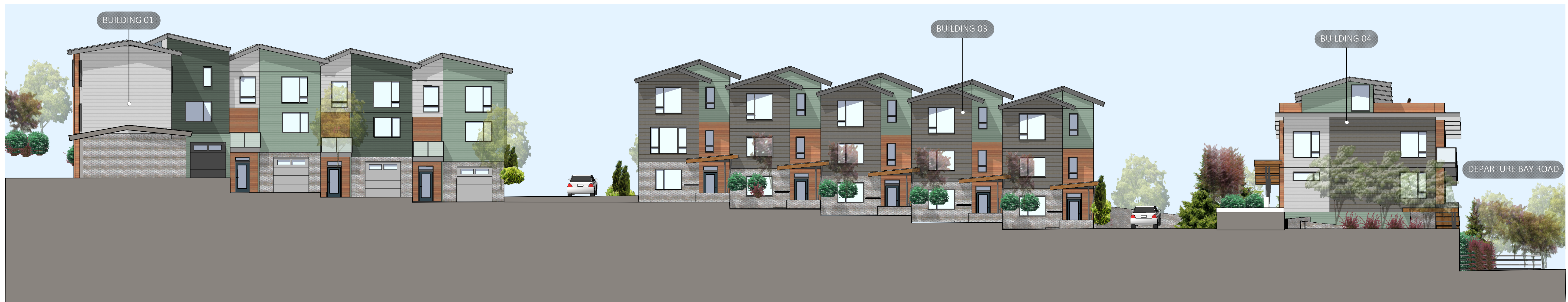
EAST WEST SECTION | Scale 1:120 |