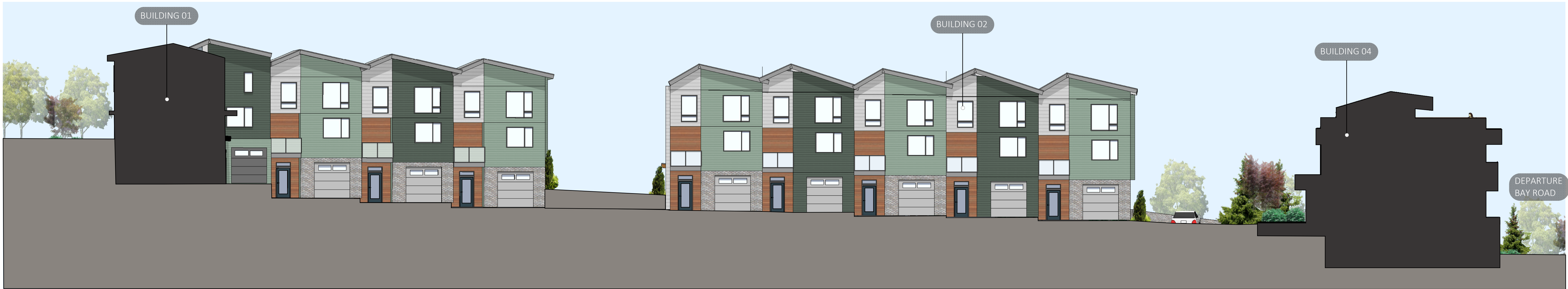
EAST WEST SECTION | Scale 1:120 |