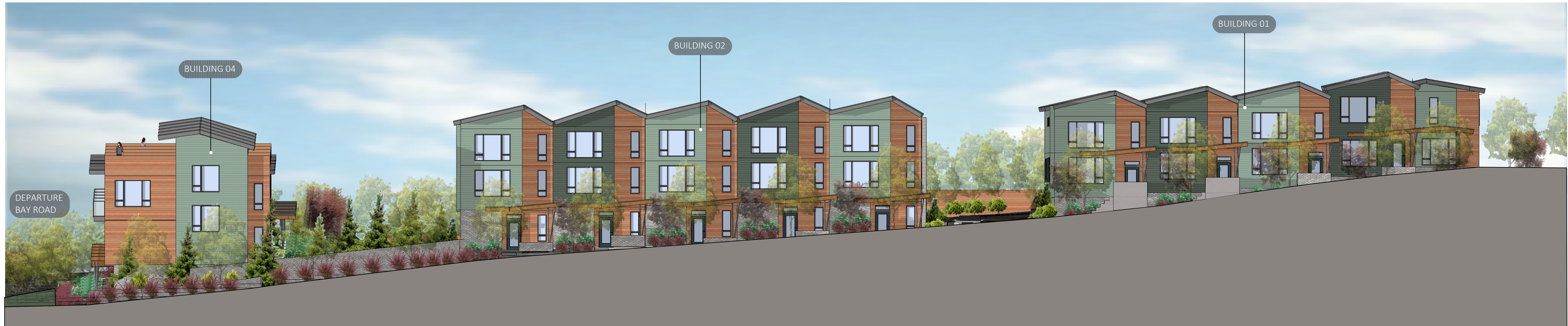
EAST WEST SECTION | Scale 1:120 | (FROM STRONGATHARM ROAD)

RECEIVED RA521 2025-JAN-06 Current Planning